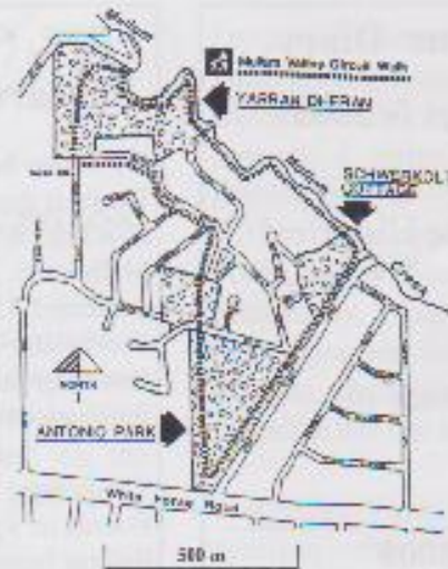
Melway Ref. 49 D7