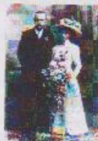
A wedding photograph NP609