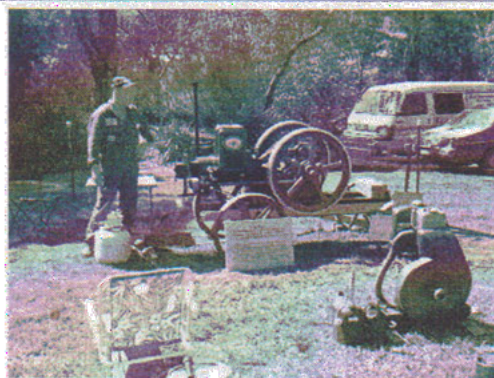
One of the many exhibitors was the Yarra Valley Machinery Preservation Society