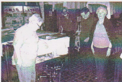
Some nice heavy sewing machines to move – okay !