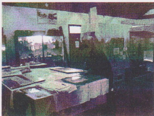
Inspecting packing .... Now where does this go??