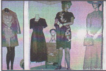
To celebrate 100 years of Women's Suffrage we have a new display of Women's Fashions of the 20th Century

Place of deposit Accredited by the Public Record Office of Victoria