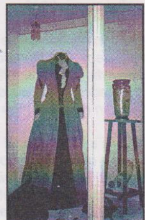
The painting of the Museum gave us the opportunity to improve our displays. The gown on the right is from our 19th Century display. The corsets above are from our "Pantaloon to G Strings" display which is another tribute to Female Suffrage and emancipation.