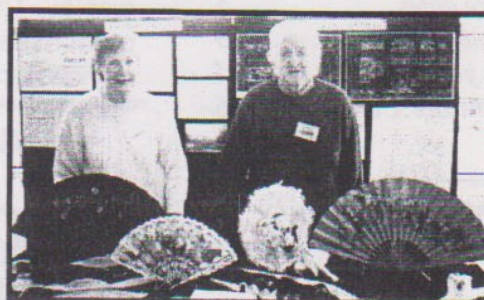
City of Whitehorse Spring Festival

WHS members participated in the 2009 City of Whitehorse Spring Festival held on the 18th October.