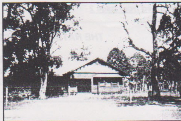
One of the Elmore houses of Blackburn NP 3156d