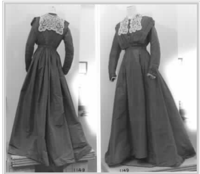
Cat no NA1149