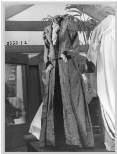
Cat no NA2552