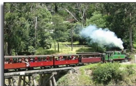
PUFFING BILLY AUSTRALIA