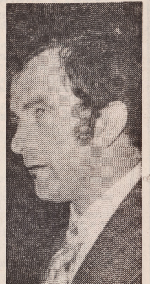
● Cr OAKLEY details of its inquiry proposal to all metropolitan municipal councils for comment and decision.

Following the passage of Cr Oakley's motion, Nunawading will send