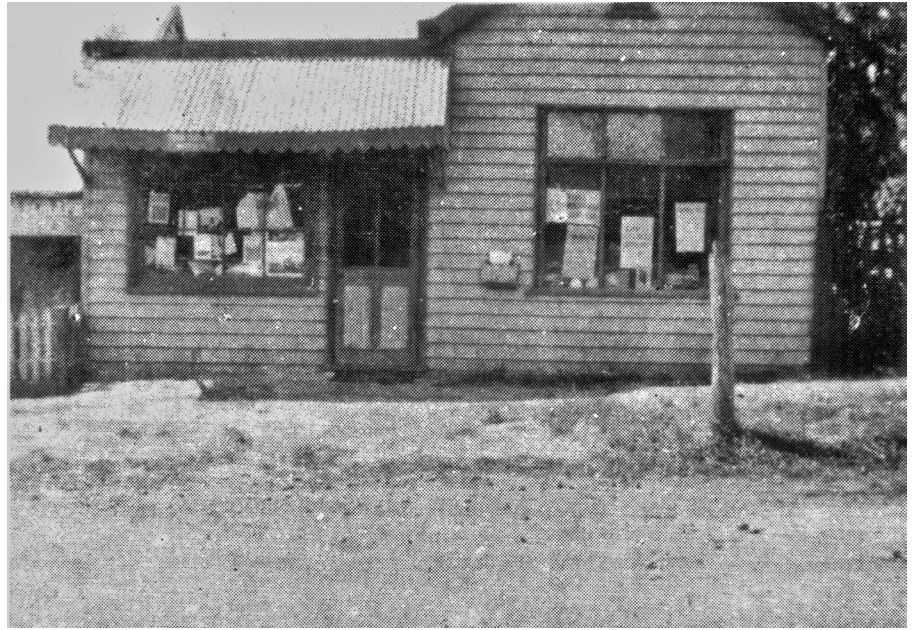
NP923 Forest Hill PO c1926

T HE suburb of Forest Hill is situated on Wurundjeri land, a clan of the Kulin tribe and is 18km from Melbourne's central business district. At the 2016 Census the population was 10,626.