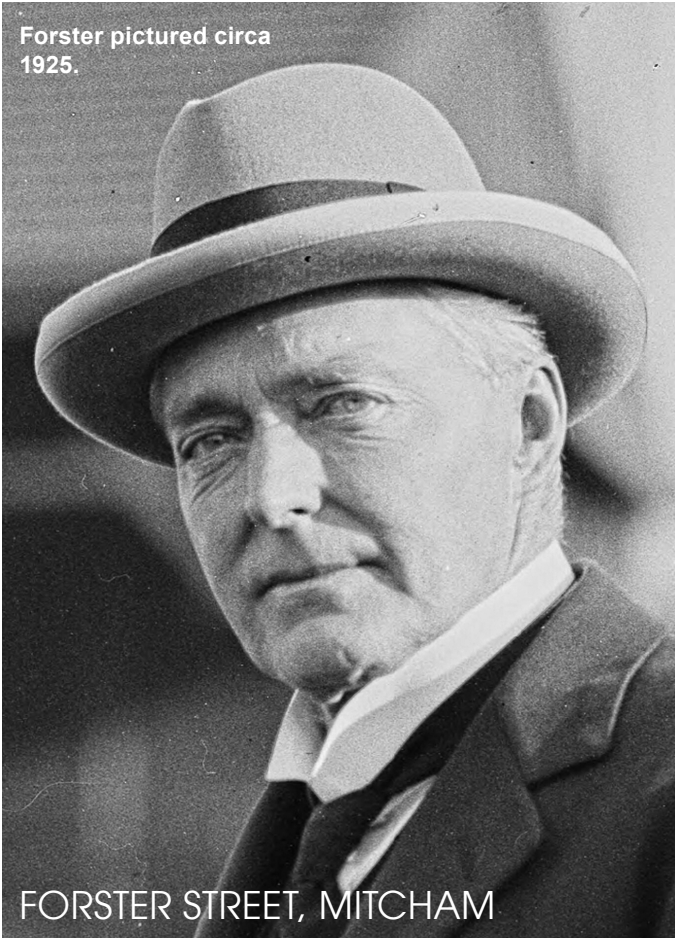
FORSTER STREET, MITCHAM

F ORSTER Street is the road next to the Heatherdale railway station and runs between Heatherdale Road and Purches Street.