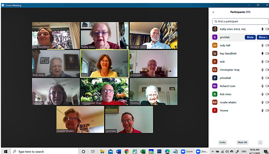
Weekly Zoom catch-ups, courtesy of Kathy's chatroom.