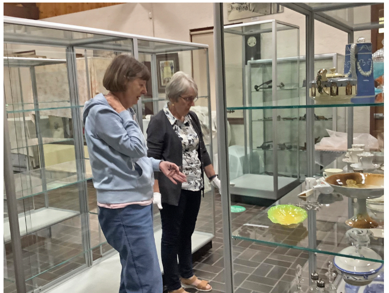
PICTURES (clockwise from top left): The cases arrive; cases installed in the museum; designing the Afternoon Tea display.

More working days to come – and watch this space for more news.