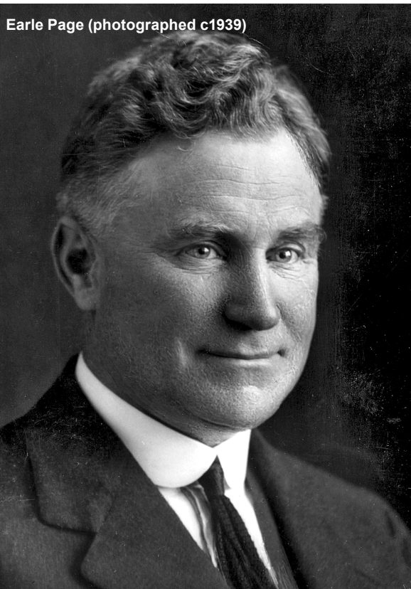
Earle Page (photographed c1939)