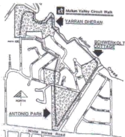
Melway Ref. 49 D7