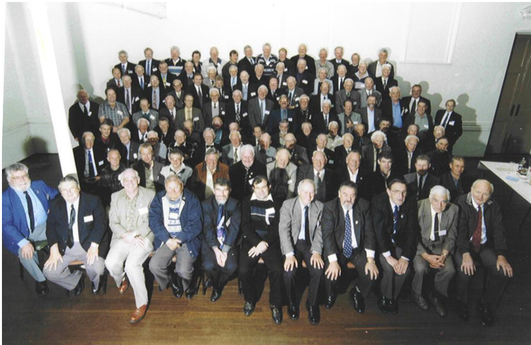
The 89 th Reunion 2002