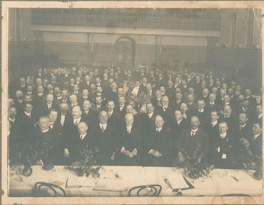
Flashlight Photo., Castlemaine Town Hall, Sept. 18th, 1912.