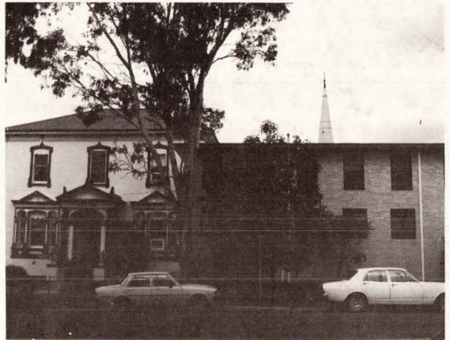
"LISTER HOUSE" 37 Rowan Street, Bendigo, 3550.