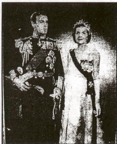
Lord and Lady Mountbatten of Burma