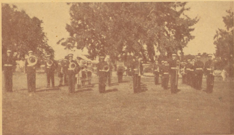
MORTLAKE CITIZENS' BAND.