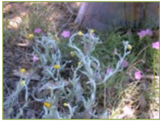
Chrysocephalum and Convolvulus in spring 2003

Strathnaver Grasslands is a tiny patch of remnant Western Plains grassland on the slopes above the Moonee Ponds Creek in the Strathnaver Reserve. In spring it has a wonderful display of wildflowers and its rich diversity of grasses, herbs and forbs, show us what the grasslands were like that used to dominate this part of Victoria. It is an area well worth a visit, particularly in spring, although it does bring a realisation of just what we have lost.