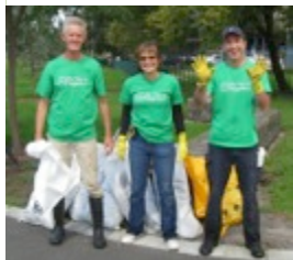
Happy volunteers with the fruits of their labours

And after all that hard work, everyone tucked into a Rotary barbeque and the wonderful African food provided by the United Somalia Women's Group and the African Women's Association, and had close encounters with native animals provided by Wildlife Action.