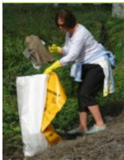
Picking up soggy rubbish down by the Creek

After the recent rains the Moonee Ponds Creek was flowing swiftly, but that didn't stop 106 volunteers signing on for Clean Up Australia Day 2012 at the Debney Meadows Primary School. Once again, CityLink Neighbourhood Connections provided a great reward for these willing participants who came to help clean up around the Creek and Debneys Park at Flemington.