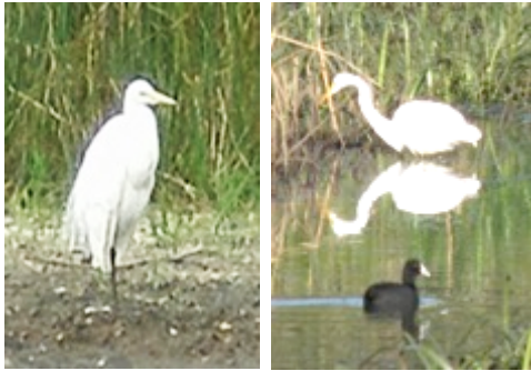
A Great Egret wearing its breeding plumage, and three weeks later, breeding plumage gone, with a Eurasian Coot, at Jacana Wetlands