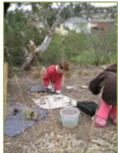
Planting grasses into bare soil in May 2008 and the same area today

Although grasslands are not at their best in autumn, it is great to see how much of the bare clay patches are being colonised with self seeding Silky Blue grass ( Dichanthium sericeum ) and Redleg grass ( Bothriochloa macra ). These native grasses are successfully competing with weed grasses, and some are growing above knee height, although there are still patches of couch and other exotic grass species. While I was visiting the grasslands this month, in just a short visit I spotted such a variety of plants I am really keen to go back in spring to see them all flowering.