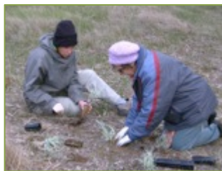
Planting Chrysocephalum in August 2005