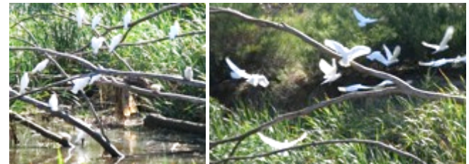
This noisy mob of Little Corellas perched on a fallen tree across the Creek at Westmeadows, then came down to drink, before flying off.

Have you seen anything exciting along the Creek? Do let us know – send us a picture and a note about when and where you saw it. We love to hear about life along the Creek. Contact us at ponderings@mpccc.org .