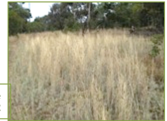
A swathe of Silky Blue grass in April 2012

The area is now maintained by Moonee Valley Council, and the past couple of years of good rains has been wonderful for the grasses and other plants including the pretty shrub Eutaxia microphylla which is struggling to survive along the Moonee Ponds Creek.