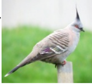
Crested Pigeons are now a relatively common sight in urban areas, since the drought they have realised the easy pickings to be had in town.