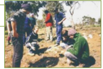
A group on a wildflower walk in October 2003 examine the struggling remnants in the bare clay soils

In the early 2000s, concerned locals and other individuals got together with the help of the MPCCC, to form the Friends of Strathnaver Grasslands, and their dedication helped to rescue this little patch and preserve it for us all to enjoy.