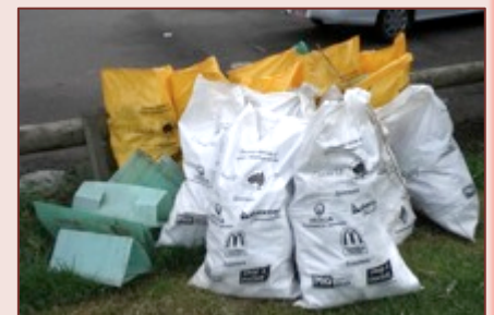
Tree guards washed down the Creek at Gowanbrae – there were lots more in the bags

At Gowanbrae a major type of 'litter' was the tree guards that Melbourne Water had used further up the Creek to protect the plantings they had done last year on the banks, well within the high flow level.