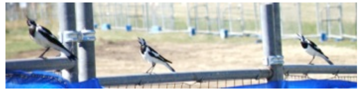
These three Magpie Larks were keeping an eye on the new ponds work going on at Jacana