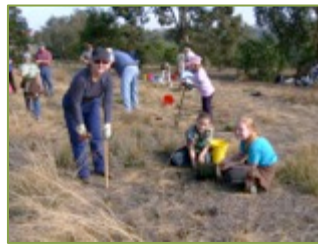
FO Strathnaver Grasslands in May 2004

It is not only spectacular trees like Red Gums that can live for centuries – these little plants are just as tenacious and in far less hospitable positions.