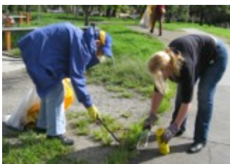
Getting down to work – collecting little bits of broken glass!