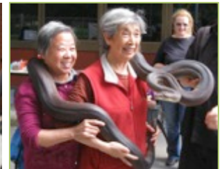
Getting up close and personal with an olive python!

Twenty-four mainly Chinese elderly, (the average age 76!), signed on at the site near Macaulay Station, to help clean up along the Creek. A bus was organised by Vic Police to pick them up and take them to the Macaulay Road site and then afterwards, to transport them to Flemington to join volunteers there for lunch and to meet our native animals.