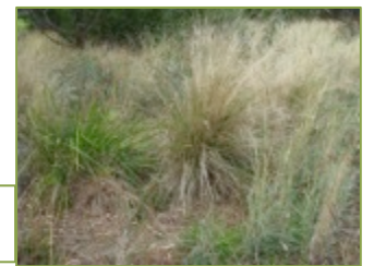
Luxurious growth in April 2012