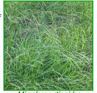
Microlaena stipoides Weeping grass

There are masses to choose from, from the large and dramatic Kangaroo grass (Themeda triandra) to the smaller, delicate Weeping grass (Microlaena stipoides). Kangaroo grass grows in most types of soils from clays to sandy soils, so it is best to source your plants locally to make sure they are adapted to local conditions. It will grow in full sun or part shade, and once established, needs little water. It flowers in summer to autumn, and has purple-tinged seed heads. Kangaroo grass needs to be cut back (or burned) every few years, to keep the seeds viable. It will form large clumps which provide good habitat for lizards. Microlaena makes a good lawn for areas with little traffic. It is a beautiful soft grass that grows in a range of conditions.