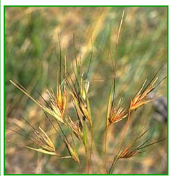
Themeda triandra Kangaroo grass

Local grasses are more suited to local conditions, they provide food and habitat for birds, lizards and invertebrates and they are just as beautiful, especially when combined with other grassland plants.