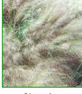
Stipa scabra Slender Spear grass

Chrysocephalum semipapposum Clustered Everlasting