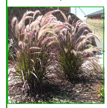
Pennisetum hybrid at a Gowanbrae house

It has become fashionable recently to use grasses as a feature in the garden, and some of them are spectacular. But before you dash off to Bunnings or your local nursery, it is worthwhile looking into the appropriateness and suitability of different species of grass. One type of grass that is particularly popular at the moment is Pennisetum sp , the fountain grasses, particularly P. alopecuroides and P. setaceum. These are beautiful tall grasses with feathery seed heads, and grow into dramatic clumps.