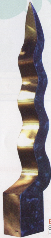
Eternal Flame 1995 Sculptor: Peter Blizzard Honors All Australians in War Time

Restaurant Café 29 Sturt st ballarat PH: 0353 334114