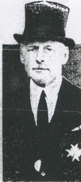
SIR WINSTON DUGAN.