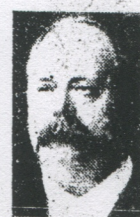
Sir George Reid.