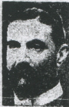
Mr Alfred Deakin.