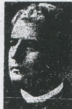
Sir Edmond Barton.

The busts unveiled were those of Sir Edmond Barton, the first Prime Minister; Mr Alfred Deakin, the first Federal member for Ballarat; Mr J. C. Watson, the first Labor Prime Minister; Sir George Reid, Mr Andrew Fisher, who was Prime Minister when the Great War broke out in 1914, and Sir Joseph Cook.