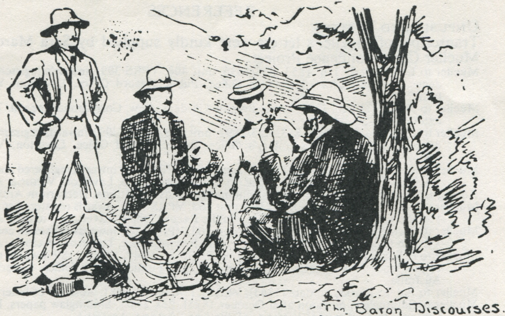
Fig. 5. The Baron Discourses reproduced from the Illustrated Australian News and Musical Times 1 Feb. 1890.