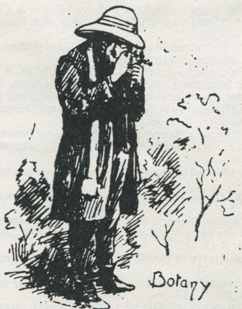
Fig. 6. Botany reproduced from the Illustrated Australian News and Musical Times 1 Feb. 1890.