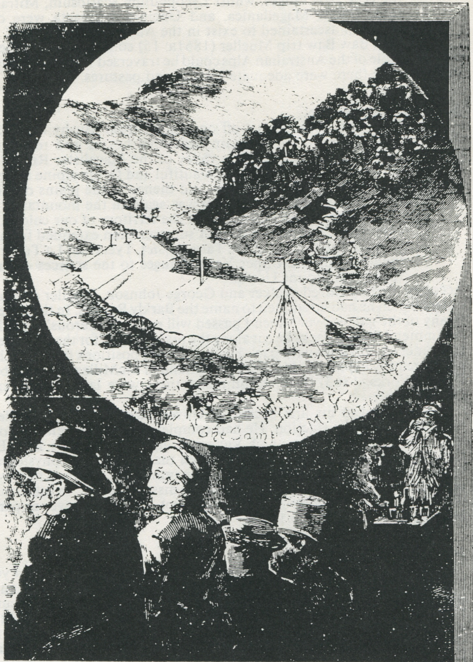
Fig. 4. The camp at Mt Hotham reproduced from the Illustrated Australian News and Musical Times 1 Feb. 1890.

(1863–78), over 200 species from the alps were cited as collected by Mueller, one third of them previously undescribed (Willis 1989).