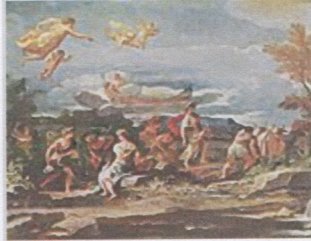
Vertumnus and Pomona by Luca Giordano (1682–1683), private collection

Pomona on the left, gracing the Beaux-Arts Peninsula (former Gotham) Hotel, New York City, built 1905, with Diana to the right. Click on the image for more information concerning this example of the Beaux-Arts style.