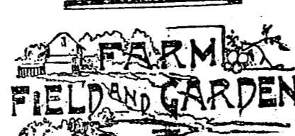
ALL ABOUT CAPONS.