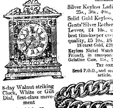
Watch Repairs Guaranteed. Silver Keyless Ladies' Watches, 25s., 30s., 40s., 50s., 60s., 70s., 80s., 90s., 100s.

When in Town call and have your Eyesight tested. GRATIS.