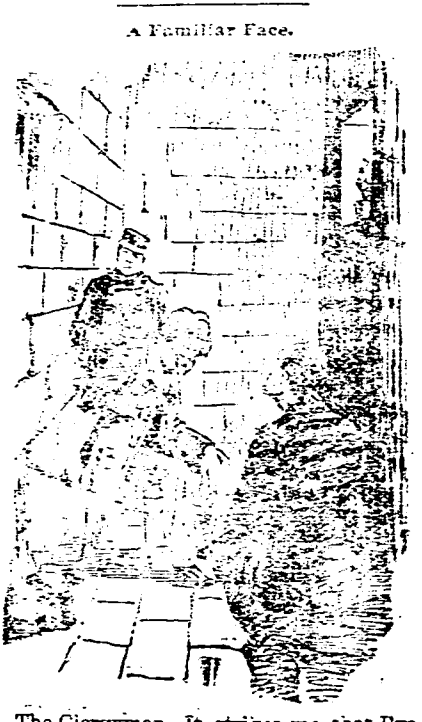
The Clergyman—It strikes me that I've seen your face before.