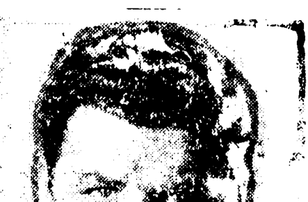
GEORGE BANKROFF "Rich Man's Folly" A Paramount Picture with FRANCES DEE, ROBERT AMES and JULIETTE COMPTON the immortal drama of a man's need for power and a child's need for love!