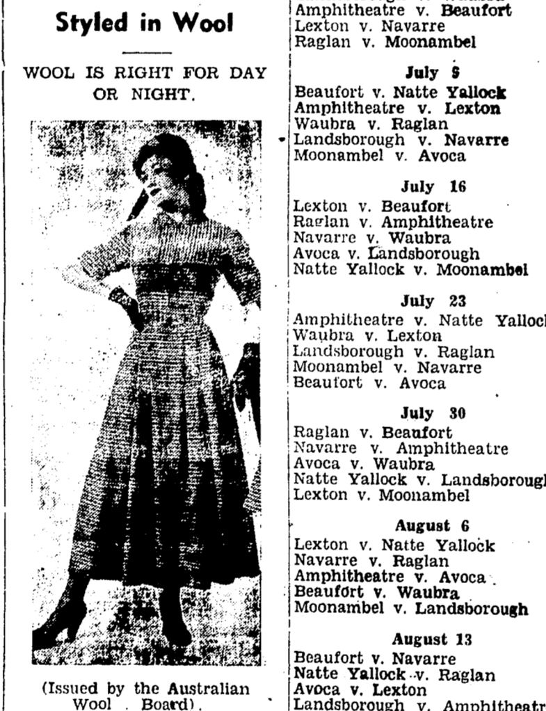
Stylish in Wool. WOOL IS RIGHT FOR DAY OR NIGHT.