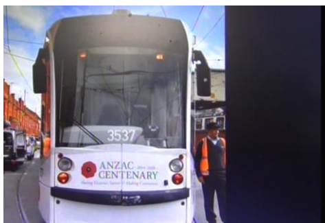
And tram 3537 with an all over Anzac Centenary scheme