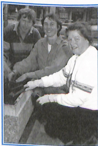
Greenlink volunteers planting native shrubs at Clayton Station.