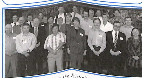
Fact-finding members from the Australia Quality Council on their visit to Metrol.

A benchmarking-study group, organised by the Australian Quality Council, recently inspected Metrol, the nerve centre of suburban train operations.