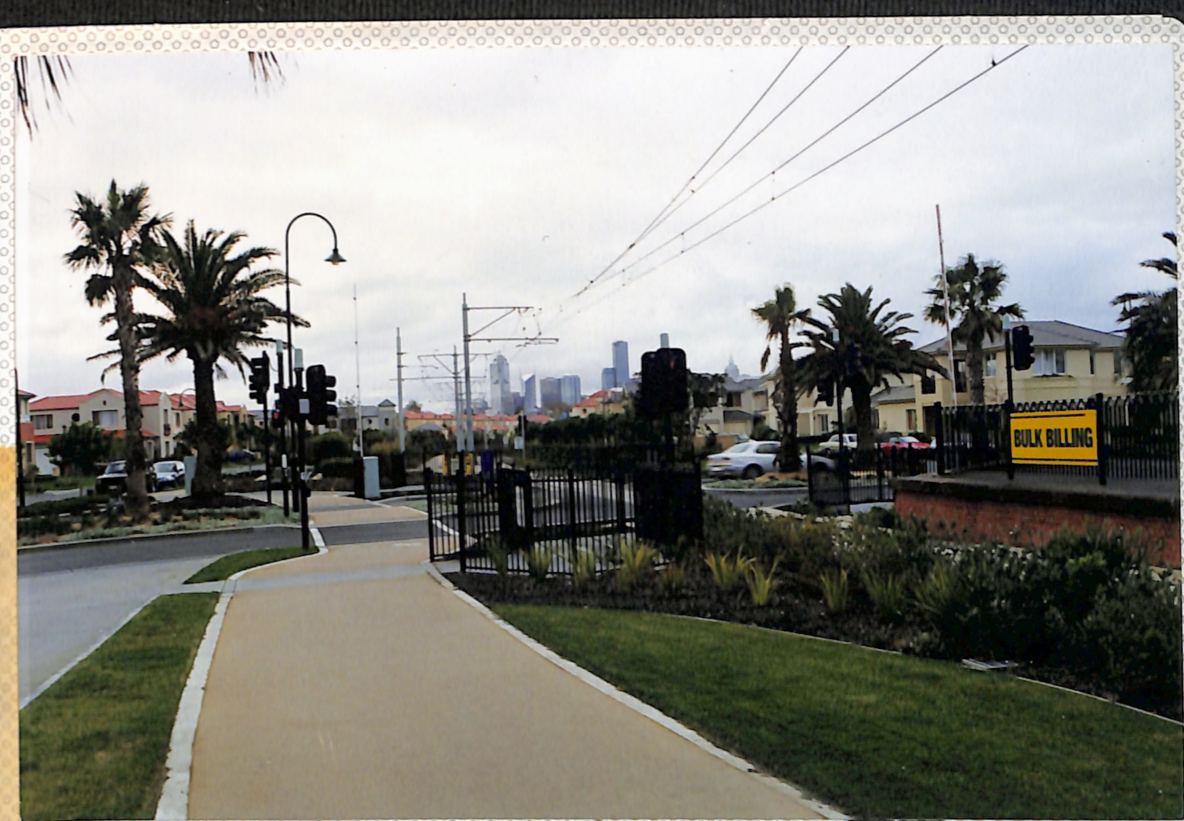
Melbourne CBD from Port Melbourne Beacon Cove