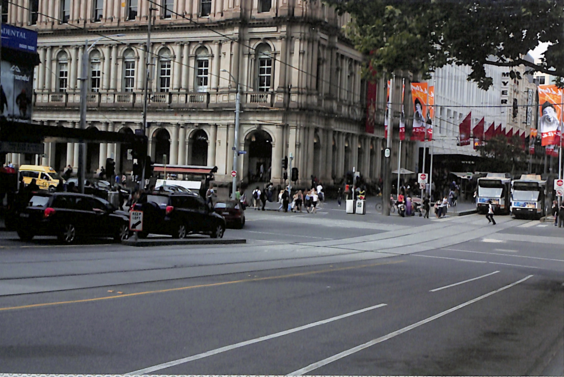
Intersection Bourke & Elizabeth Sts 11/11/11 K Yarra Trams No C3020 Internal night shot 12/11/11