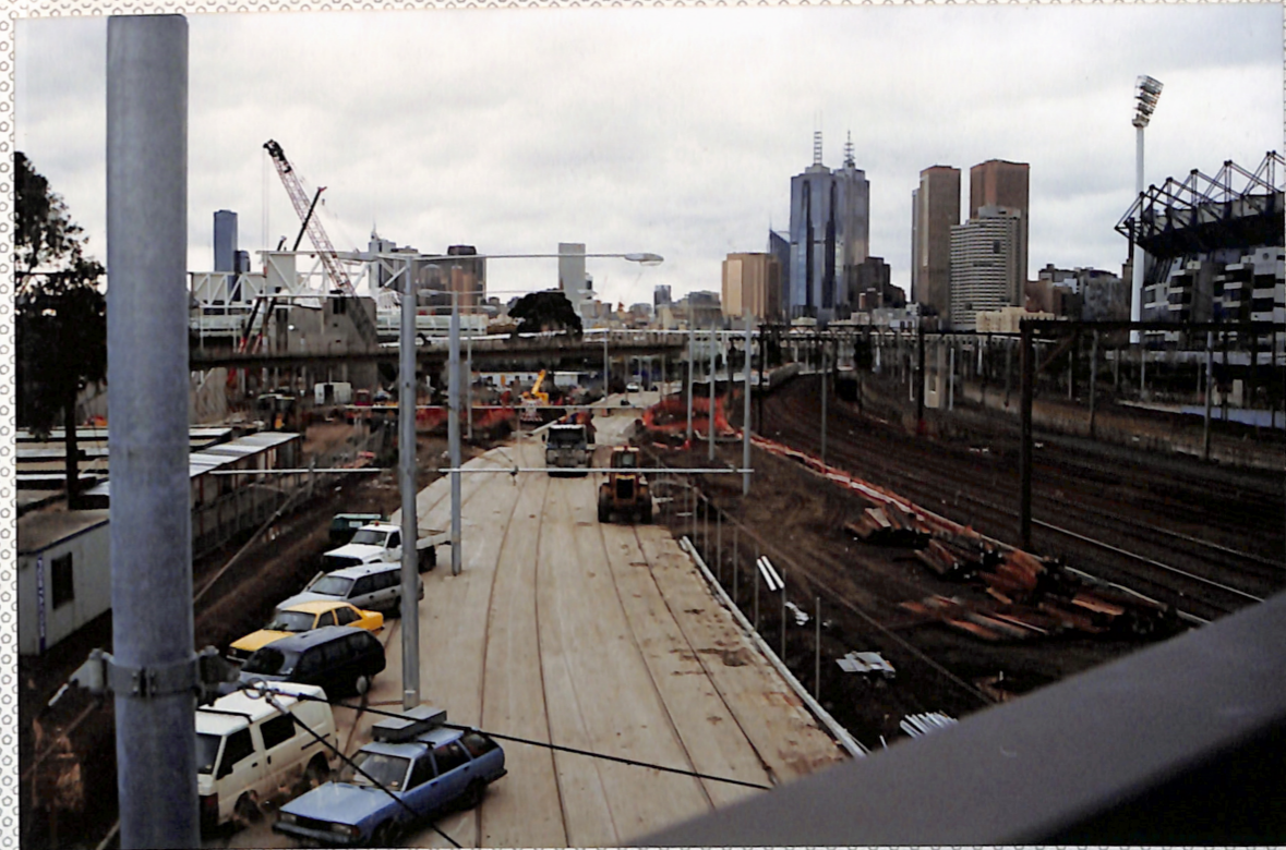
View of works on the Swan St to Flinders St deviation looking West 26/5/99