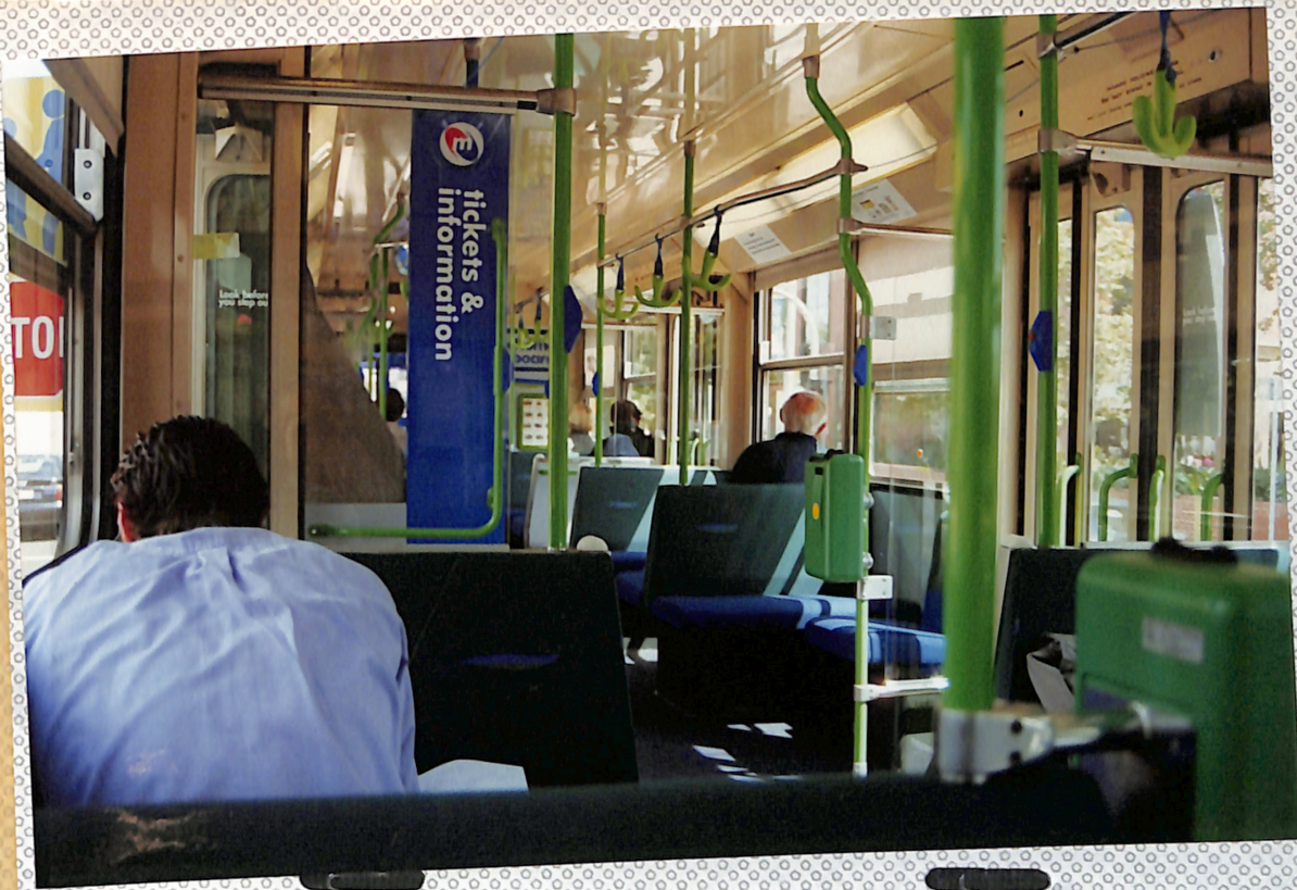
Yarra Trams A2 262 YT Interior Colour Scheme 30/10/00 The MET Z3 175 Interior layout 8/4/88