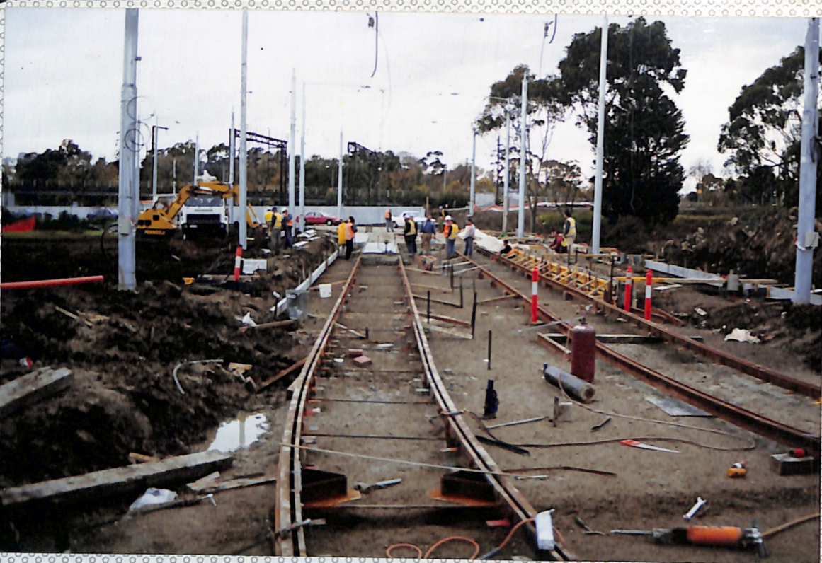
Tracklaying on the Swan St to Flinders st deviation at the Swan St 26/5/99