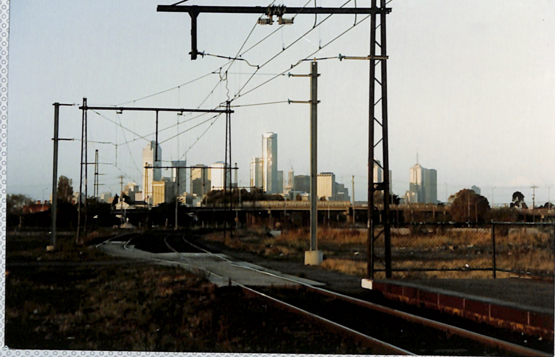
View of City Skyline from original Port Melbourne terminus 30/3/91