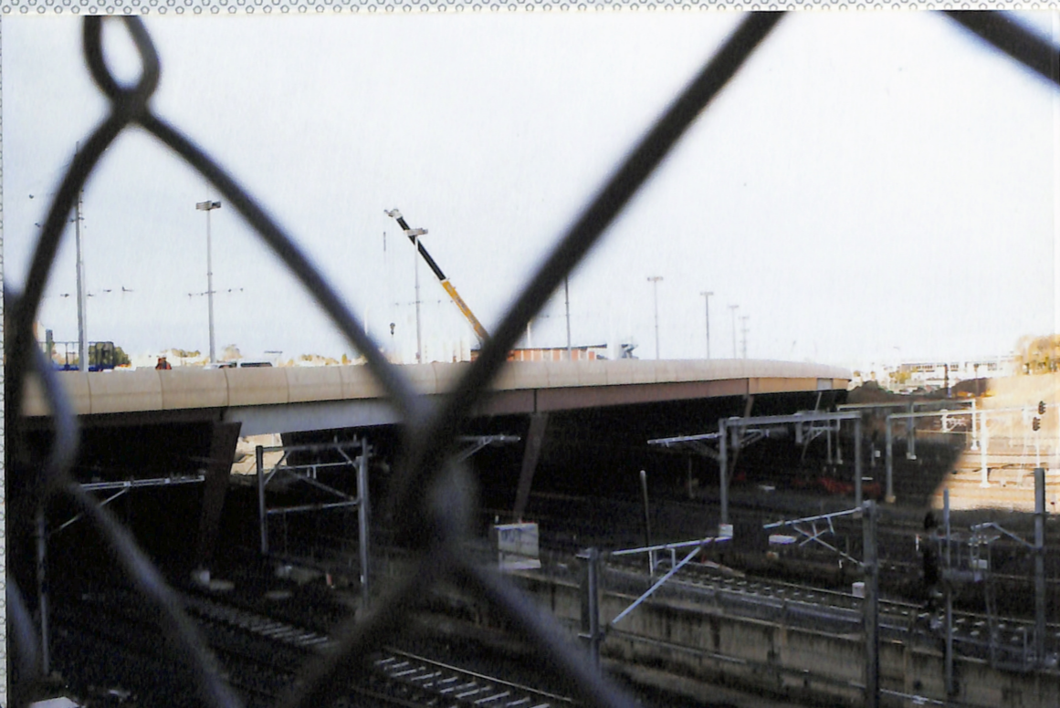
The new Jolimont Bridge on the Swan St to Flinders St deviation 26/5/99