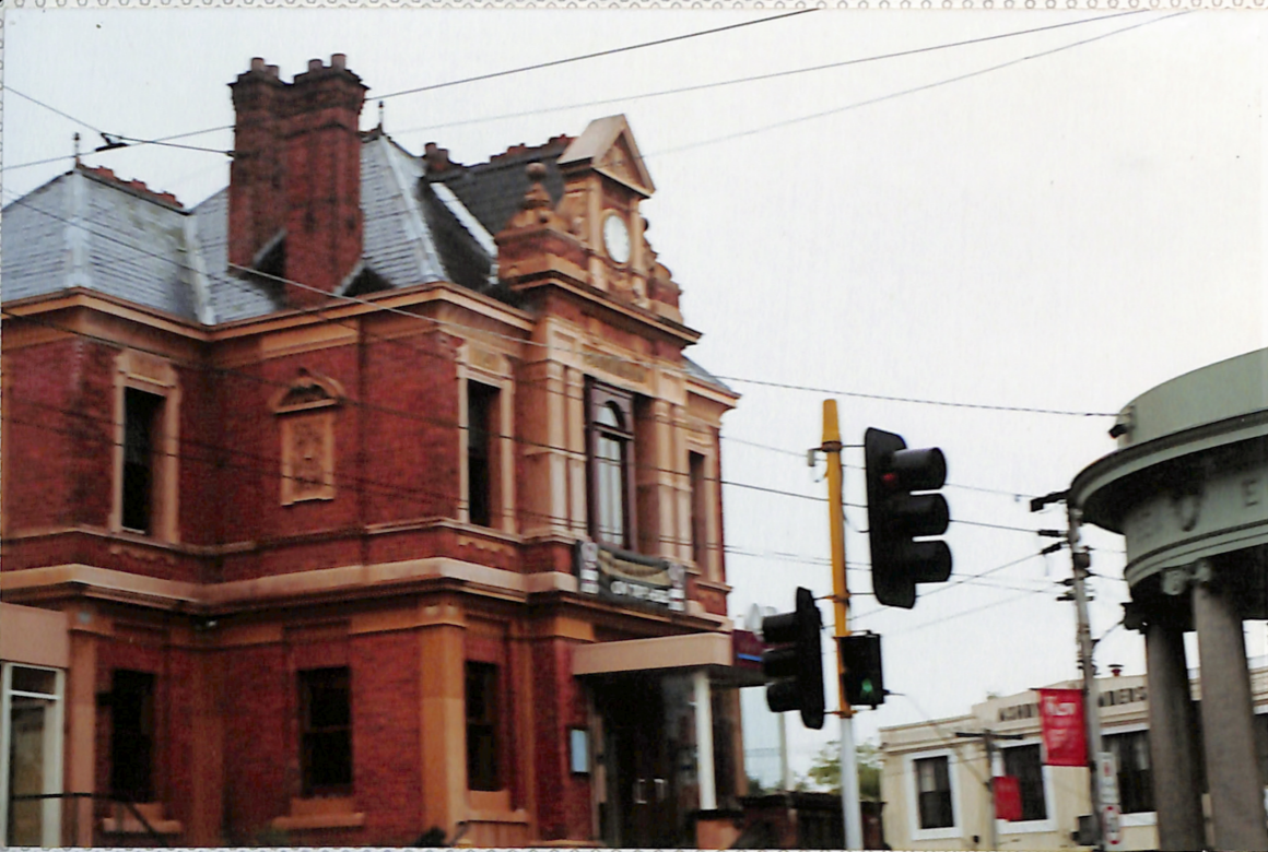
Kew Town Hall Kew Junction