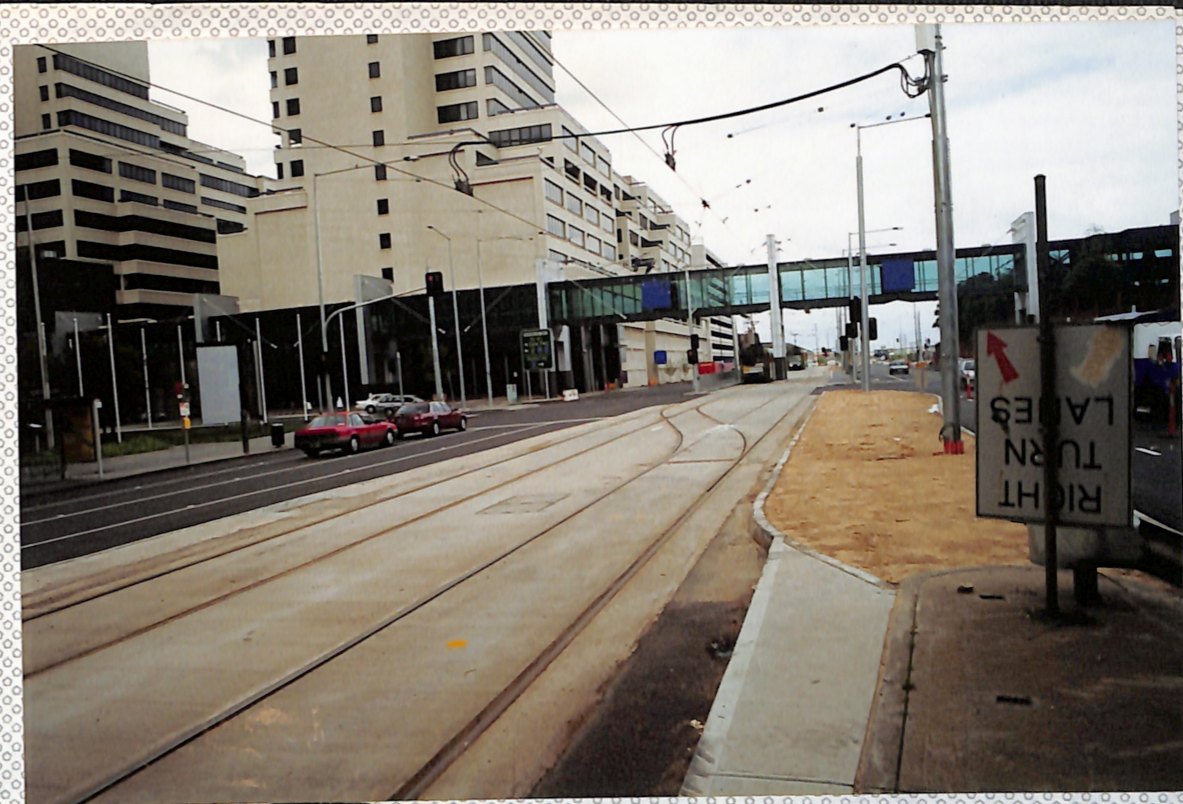
New City Spencer & Flinders Sts terminal