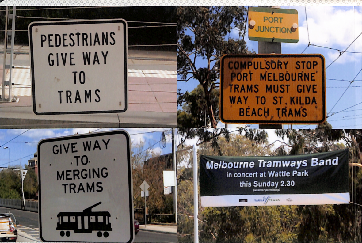
Collection of "interesting" signs