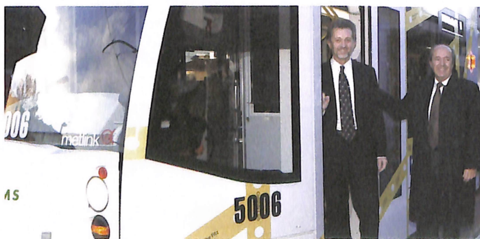
Transport Minister Peter Batchelor and Yarra Trams CEO Hubert Guyot board a five-module Combino tram at the St Kilda Station stop on route 96.

Yarra Trams is progressively introducing five-module, low floor trams on route 96 (St Kilda Beach to East Brunswick via Bourke Street).