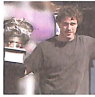
SPECIAL EVENT CHAMPIONS PAGE 04