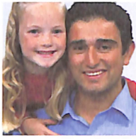
GOOD FRIDAY APPEAL PAGE 04