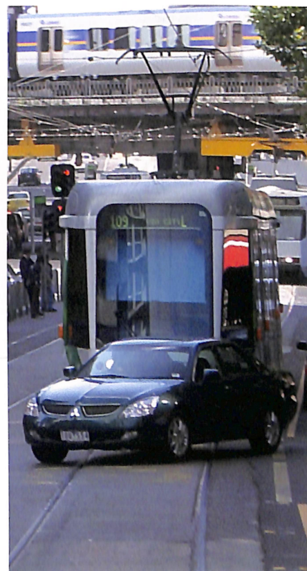
Spencer Street at Flinders Lane