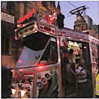
FESTIVAL ON A TRAM PAGE 03