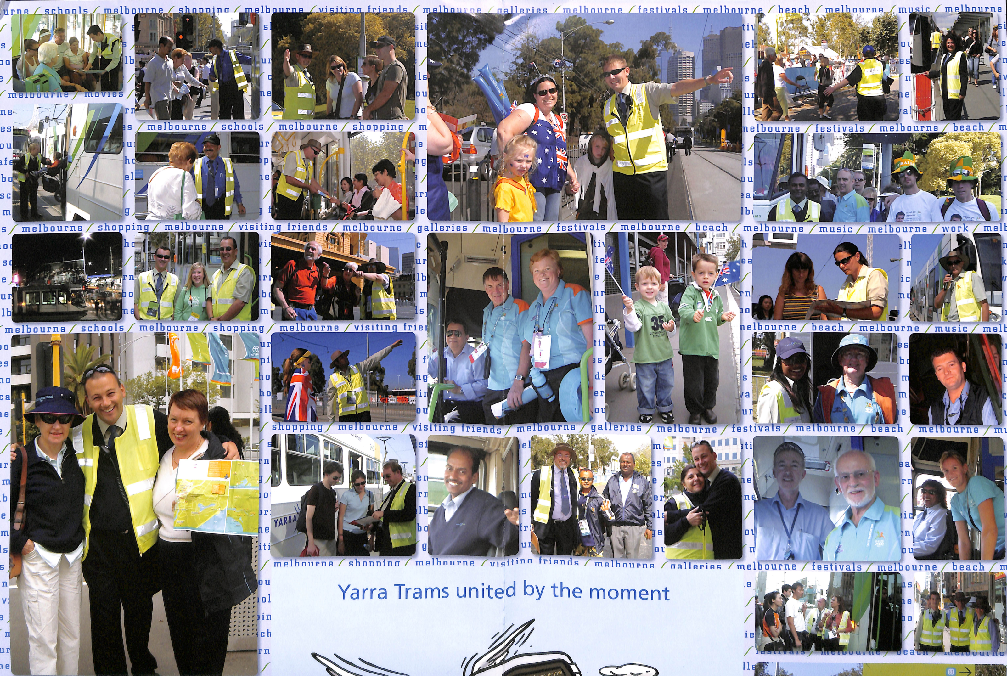
Yarra Trams united by the moment