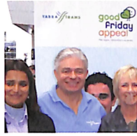
ONE MELBOURNE ICON SUPPORTING ANOTHER PAGE 04