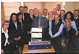
PARENTS LOUNGE OPENS AT RCH PAGE 04