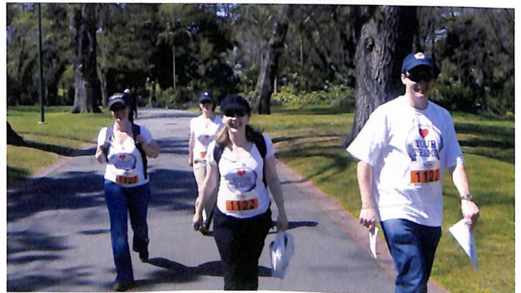
Above: These rompers wearing Love Your Trams T-shirts called themselves Smartarray which makes more sense spelt backwards.

The Yarra Trams/Go For Your Life Melbourne City Romp raised approximately $97,000.