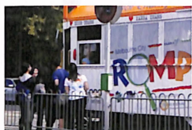
ROMPING AROUND MELBOURNE PAGE 02