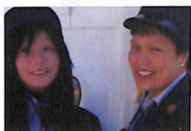
CELEBRATING DEMOCRACY PAGE 03