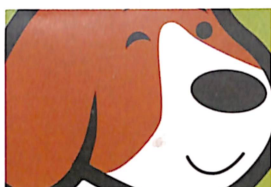
tramTRACKER GOES ONLINE PAGE 04