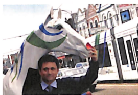
ART HORSE PAGE 4