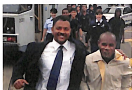
FROM KOKODA TO ESSENDON PAGE 3