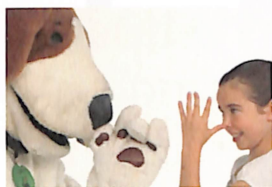
WHERE'S JAKE? PAGE 2