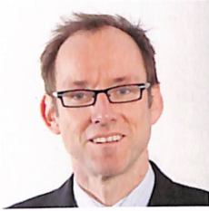
PUBLIC TRANSPORT OMBUDSMAN VICTORIA

I am very pleased to have this opportunity to introduce myself to Yarra Trams customers.