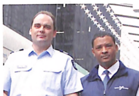
VALUABLE TEAMWORK PAGE 4