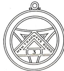
Type B (ii)