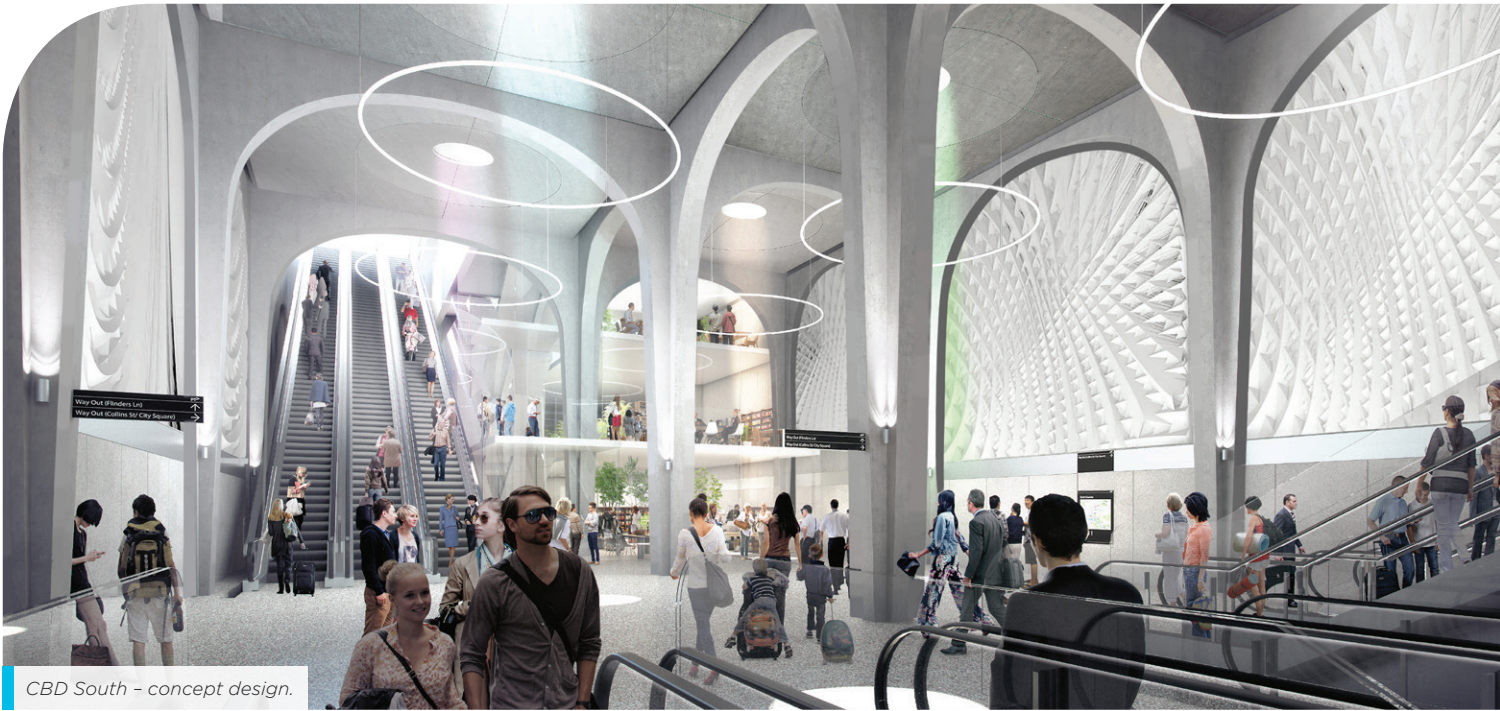
CBD South – concept design.