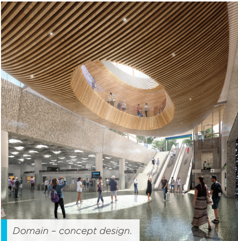
Domain – concept design.

These designs continue to be refined to achieve the best outcome for Melbourne.