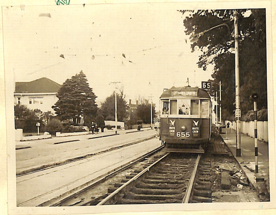
W3 655 on temporary track