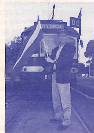
Niki Lauda recently supported the friendship between Melbourne and Vienna's tramways by offering City Circle Tram passengers the chance to win two return tickets to Vienna flying Lauda-air.