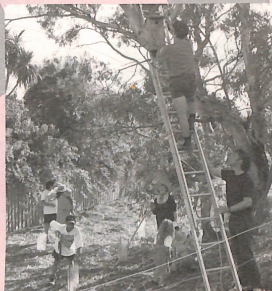
Stationeers Program volunteers work to beautify Melbourne's train stations and surrounds.

If you are interested in establishing a Stationeers project in your area, or wish to join a current project at your station, call Keep Australia Beautiful on (03) 9326 6289.