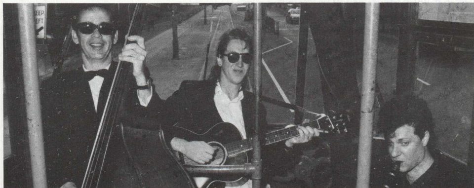
Jazz is the optional extra, but was enjoyable as the first of the trams in the new service made its way to St Kilda beach