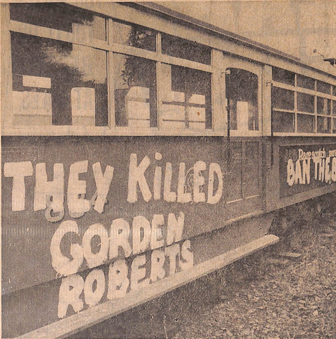
One of the trams which were daubed at the Preston depot during the night.

On February 17 the front of the Coburg Town Hall, in Bell St., was daubed with swastikas and the words "Ban the Bash".