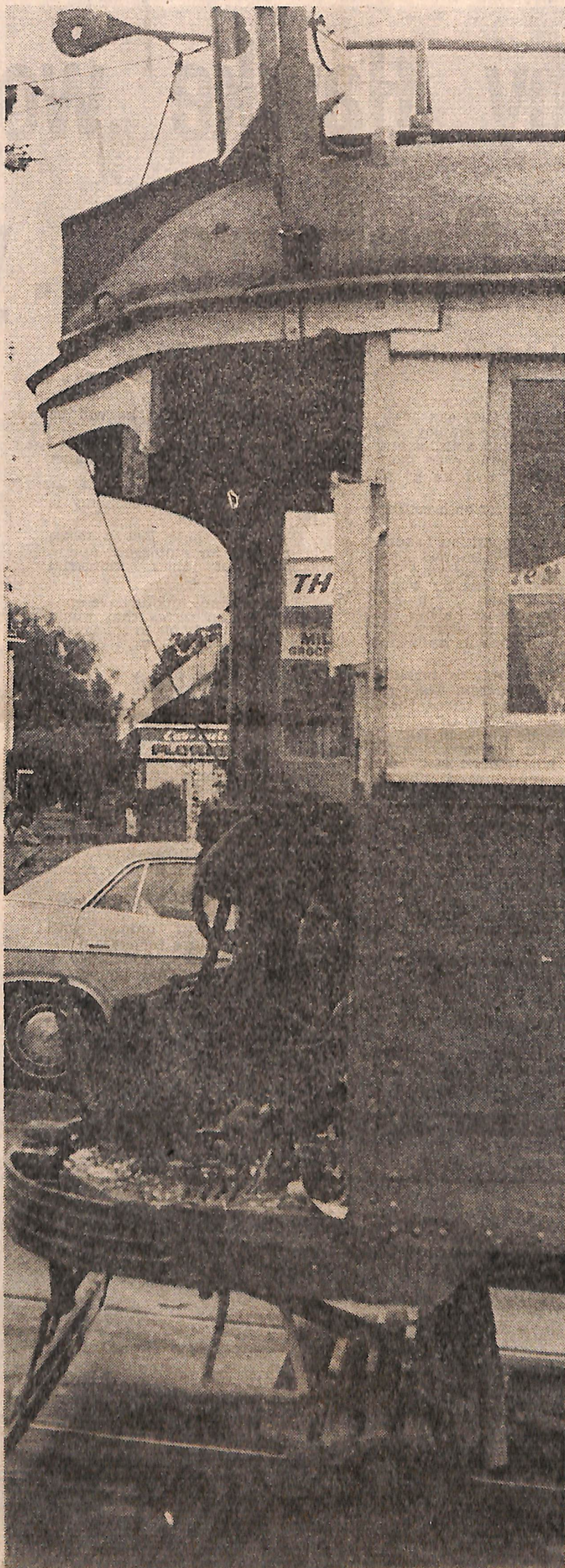
The damaged cabin. The driver was thrown out.