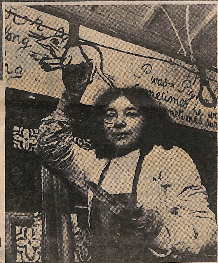
HAVING to stand up on a long tram ride is no joke — but straphangers on this tram won't find the trip so dull with plenty of Mirka's verse and drawings to read.