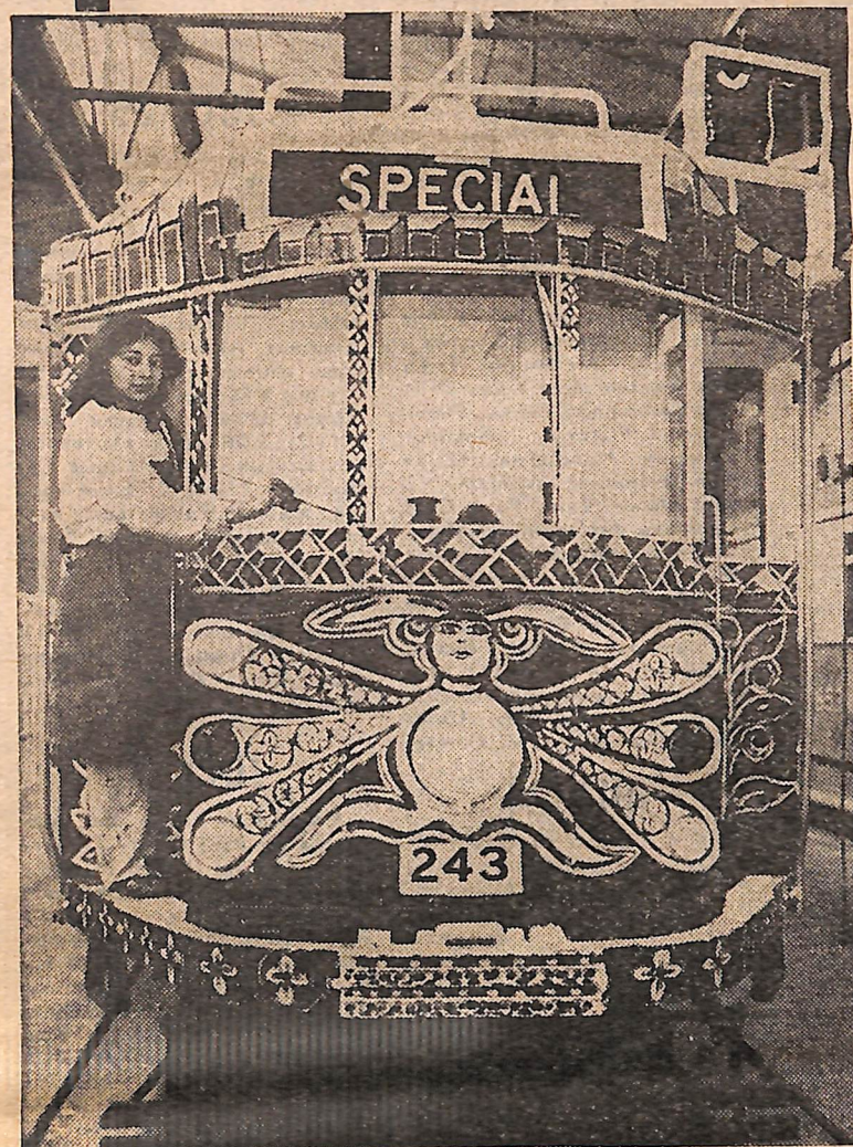
MIRKA has transformed the front of this tram from a dull green to a dazzling red and white design.