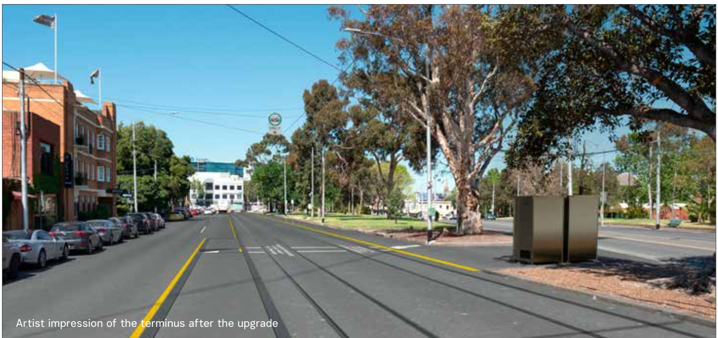
Artist impression of the terminus after the upgrade