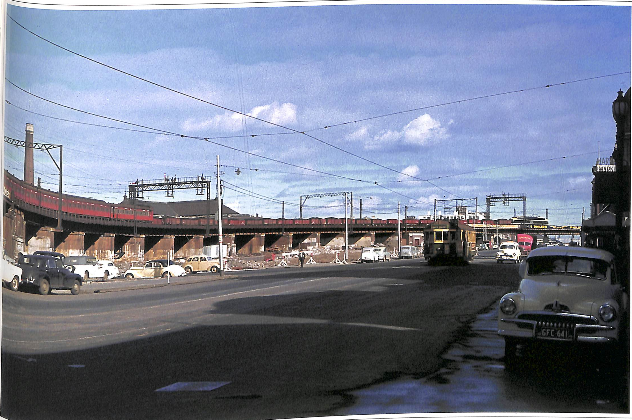
A Victorian Railways 'Tait' suburban train overtakes a brown coal train hauled by an L class electric locomotive on the Flinders Street viaduct, as W2 537 heads east along Flinders Street near the old Fish Market site. August 1958.