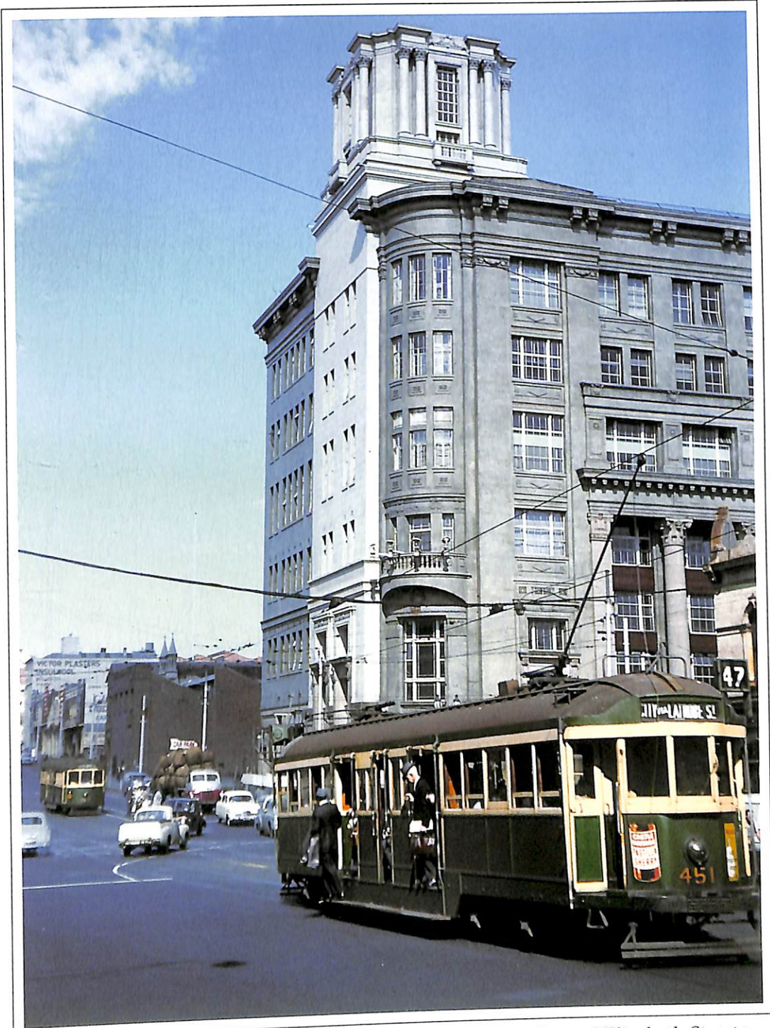
The old Argus newspaper building at the corner of LaTrobe and Elizabeth Streets Melbourne provides a backdrop for W2 451. December 1959.

We are proud to present a further collection of scenes of the city and metropolitan Melbourne, featuring its famous and much loved trams. These images from the 1950s and 1960s provide a fascinating look at the various types of trams which operated each day, against a background of buildings, motor cars, advertising and the way of life that was Melbourne in this by-gone era.