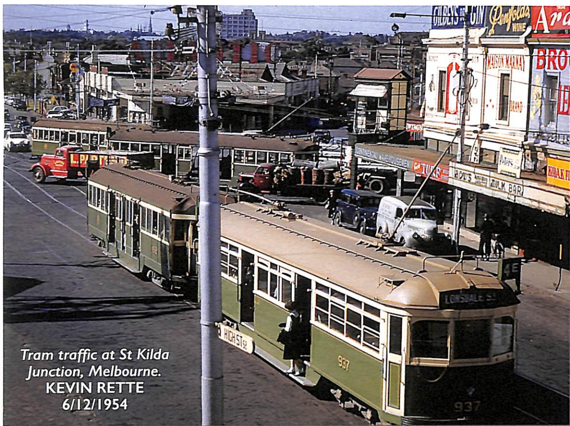
Tram traffic at St Kilda Junction, Melbourne. KEVIN RETTE 6/12/1954

A nostalgic look at Australian tramways in the 1950s