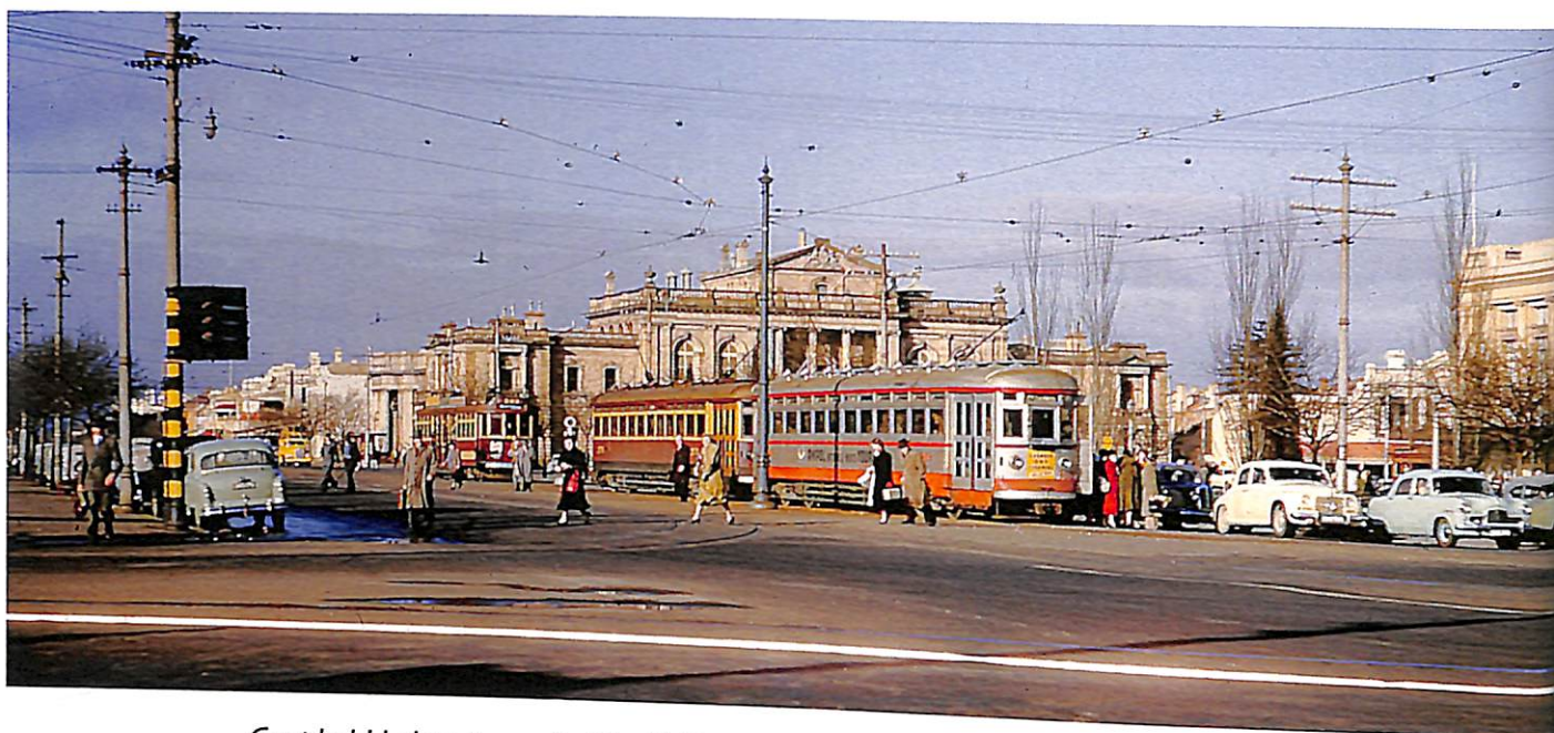
Coupled H class trams in King William St at Victoria Square, Adelaide. 2/8/1954