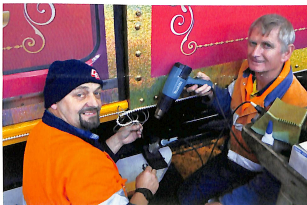
ABOVE: Final touches for the City Circle sleigh from staff at Preston Workshops.

Lord Mayor Robert Doyle said: "What better way to share in the Christmas spirit than on the iconic City Circle Tram."